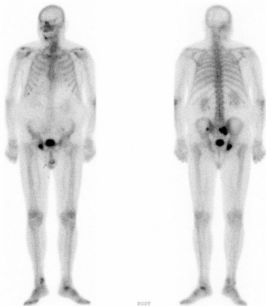
Fig. 3. New bone scan showing advancement of the bone metastasis

treatment based on radium-223. The CT scan of the chest, abdomen and pelvis displayed advancement of the bone metastasis without visceral or lymph node disease (Fig. 4). A basal haematological evaluation was carried out including an absolute neutrophil and platelet count, as well as an assessment of hepatic and renal function, which did not contraindicate the start of treatment. In this context of symptomatic bone disease without visceral or lymph node disorders, it was decided that treatment based on radium-223 be initiated.