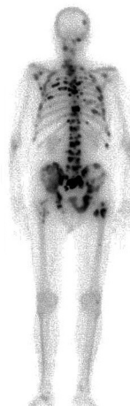
Fig. 5. Diffuse bone metastasis on bone scintigraphy

At the end of December 2016, the bone and CT scans displayed further progression of the bone metastasis (Fig. 5). The patient was re-admitted twice with anaemia, requiring a blood transfusion. At the end of February 2017, they were admitted again for anaemia, requiring a transfusion (Hb = 6.7 g/dl), and predominantly evening asthenia with bone pain controlled by means of a second-grade analgesic treatment (tramadol). The monthly follow-up appointments were continued (for the control of the anaemia and the pain).