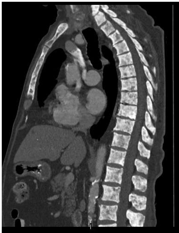
Fig. 4. Chest, abdomen and pelvis CT scan; advanced bone metastasis; lack of visceral or lymph node metastases

treatment based on radium-223. The CT scan of the chest, abdomen and pelvis displayed advancement of the bone metastasis without visceral or lymph node disease (Fig. 4). A basal haematological evaluation was carried out including an absolute neutrophil and platelet count, as well as an assessment of hepatic and renal function, which did not contraindicate the start of treatment. In this context of symptomatic bone disease without visceral or lymph node disorders, it was decided that treatment based on radium-223 be initiated.