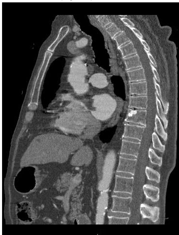
Fig. 2. CT scan showing advancement of the bone metastasis

At the beginning of December 2015, after 27 months of treatment, PSA levels were 30.43 ng/ml, with significant asthenia and pain controlled by means of the prescribed analgesic. Alkaline phosphatase levels reached 342 U/l and a new extension study with a CT scan and bone scan demonstrated advanced bone metastasis (Fig. 2, 3).